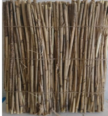
Figure 1. Model sample of a heat-insulating mat from reeds.

For the study of thermal conductivity, the reed samples of average sizes were used: 10 mm in diameter and 310 mm in height, bound in 150 \times 150 \times 25 mm mats (Figure 1).