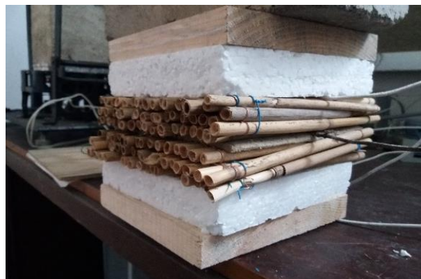
Figure 3. The process of determining the thermal conductivity of the mat sample made from reeds under the action of a heater.

To establish the thermophysical characteristics of the mat made from reeds, the study of the thermal conductivity under the action of the heating device (Figure 3) was completed. The studies on the maximum temperature ( 0.5T , °C) and the duration of the induction time of temperature transfer through the mat layer made of reeds were performed using the above-mentioned method and equipment, and the respective results are shown in Figure 4.