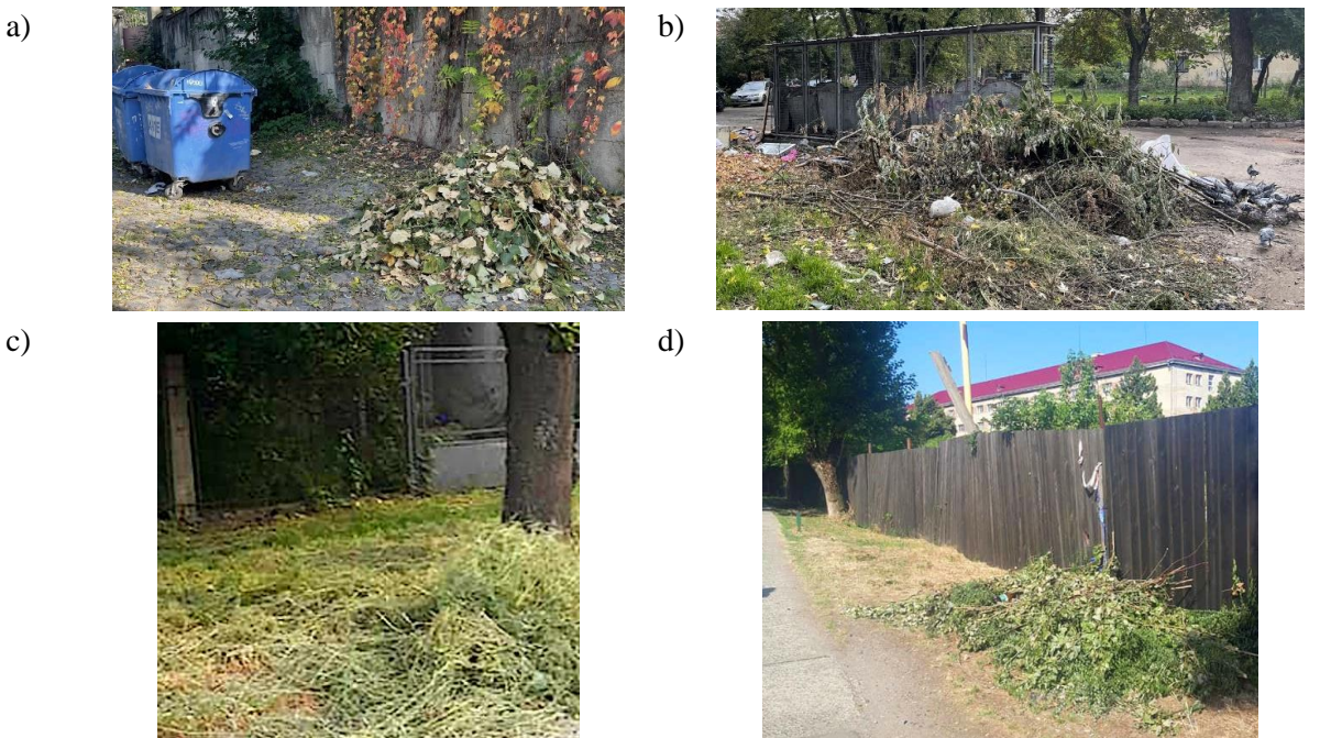
Fig. 2. Unauthorised damps: a - near trash cans; b - near a trash can area;<math>c - in a private houses area; d - at a street

should be treated at a temperature not less than 55 °C for two weeks continuously or 65 °C (in closed equipment -60 °C) for one week. Technology water should be properly treated before disposal.