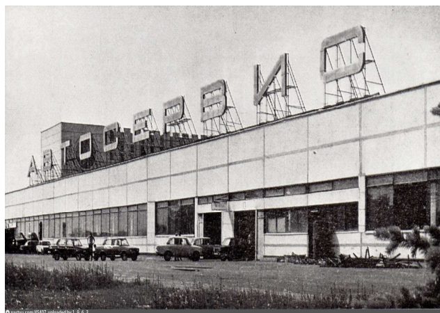
Fig.2. The facade of the station servicing tires car 25 work stations in 1987

In 2000 the State Department on Road Transport was established (within the Ministry of Transport and Communication of Ukraine), which is the administrative body of state management in road transport and operates within the transport infrastructure. “Ukravtotrans” performs respectively the following tasks and functions: provides in accordance with the law the state regulation in automobile transport and exercises control over the adherence by