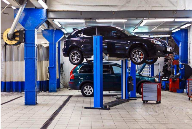
Fig.3. Example serviced individual use of cars at the station in 2017

Due to the estimates of predicting sales, lifecycle and profit potential of a particular segment or product market, we can perform a full analysis of the attractiveness of the market (Fig.4). This approach is important for making decisions on the volume of investments in construction of such facilities in future and their production capacity [18].