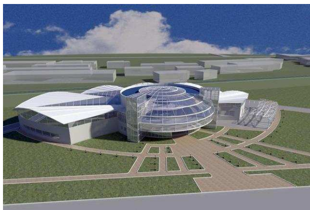
Fig.5. Example design visualization service stations for passenger cars. A look at the future

manufacturing and the car park was formed due to the acquisition of vehicles via imports, even now we use both domestic and foreign brands.