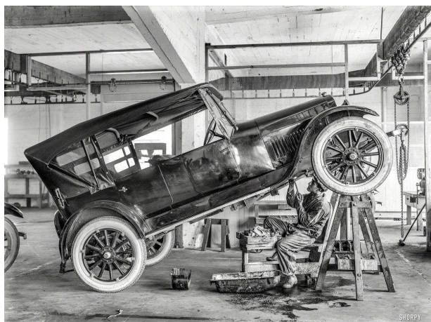
Fig.1. Example Car maintenance station in 1932

Until 1959 in Ukraine, there were no automobile plant. Therefore, its fleet was formed as a result of the acquisition of cars for import and manufacturing plants built in Russia and other republics of the former Soviet Union (Fig.1).