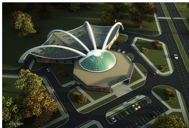
Fig.6. Example draft unified stations for cars individual use. A look at the future

2. We have analyzed historical periods of the automotive industry. Enterprises of road transport are relatively new types of structures, the occurrence of which is associated with the rapid development of the car park, freight and passenger transport. Change of market potential of services for motor vehicles depends on time and external factors: the traditional approach, habits, cultural values, income, technology, prices, legislation, etc.