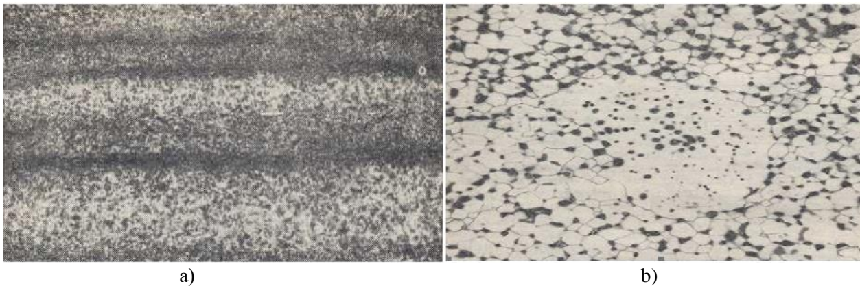
Figure 2. Structure of metal-polymer material with the content of shielding substance of 15 %: a) material surface ( \times 150 ), b) material cross-section surface ( \times 250 )

geometric parameters of the screening particles of medium or mean dispersion are easily determined by the metallographic method. This method enables prediction of the protective properties depending on the parameters of the field that require shielding. The shielding coefficients of the developed facing materials make them usable not only for protection of people from electromagnetic influences. They are suitable for solving the problems of electromagnetic compatibility of electronic and electrical equipment and technical protection of information. It is important to determine the possibility of increasing the efficiency of the developed protective materials. This was carried out through the metallographic research. The surface of the material and its cross-section (the inner part of the section) were investigated.