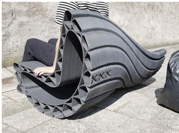
Fig. 8. Recycled plastic bench, Amsterdam, Netherlands, The New Raw, https://thenewraw.org/Print-Your-City-Amsterdam