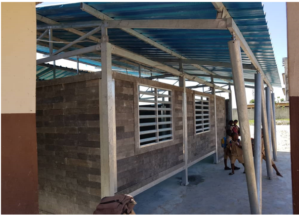
Fig. 10. The school in Colombia, http://conceptosplasticos.com/

Recycled materials constructions are high durability, resistance to chipping, and low-cost. Therefore, we can use them in detention facilities to resist walls deformation for prevention prisoners from escaping. Sustainable and diverse materials based on recycling materials can be a major component in the industrial production of low-cost pavement elements, as well as aesthetically appealing elements of improvement (Fig. 11).