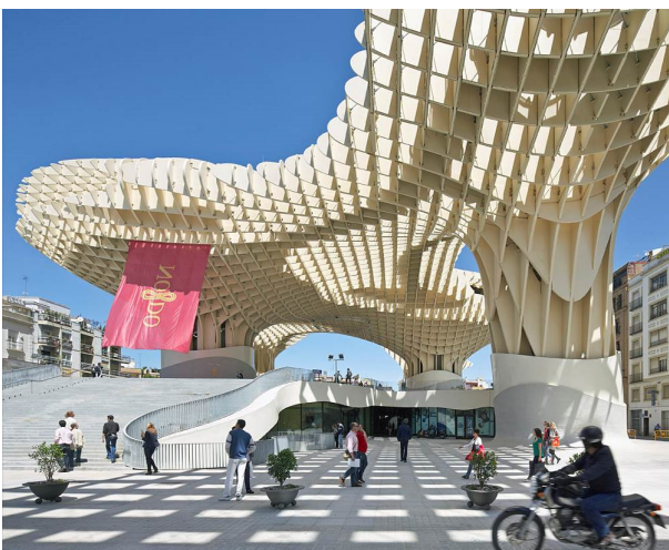
Fig. 5. Metropol Parasol. Seville, Spain, http://www.twofeet-oneworld.com/2017-12-two-days-seville/dsc00843/

Maintaining the historical architectural ensembles unity and the modern constructions are key importance in the process of reorganizing existing open public spaces or creating new public life centers in multi-tiered urban structures. The constructive system of the objects introduced into the formed urban environment is an important element that influences their three-dimensional solution. For the erection of multilevel urban structures, we propose to use beam, beam-cantilever, arch, frame, and combined structural schemes. The structural scheme of a multi-tiered urban structure can transform it into a visual dominant for the entire city area [17] (Fig. 5) or facilitate its maximum integration into the existing architectural environment [18] (Fig. 6).