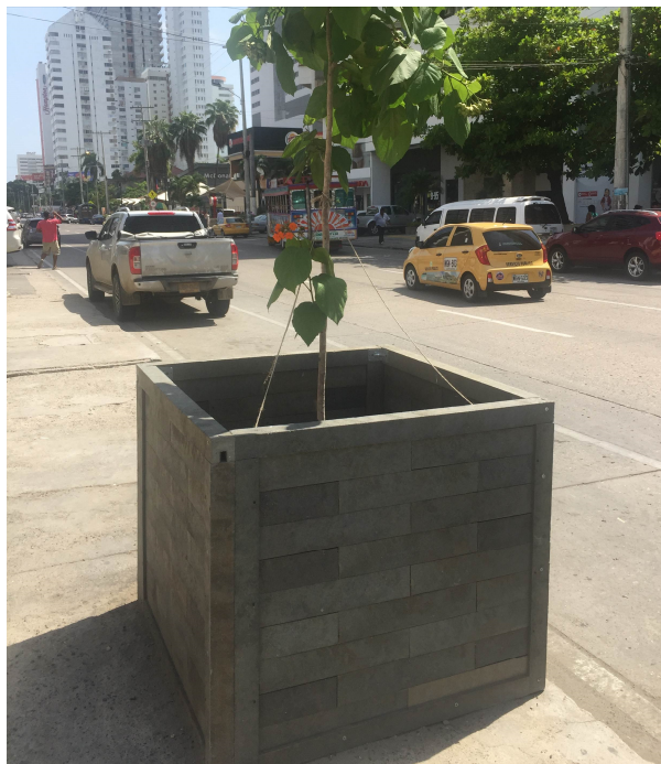
Fig. 11. Capacity for the plant, http://conceptosplasticos.com/

Recycled materials constructions are high durability, resistance to chipping, and low-cost. Therefore, we can use them in detention facilities to resist walls deformation for prevention prisoners from escaping. Sustainable and diverse materials based on recycling materials can be a major component in the industrial production of low-cost pavement elements, as well as aesthetically appealing elements of improvement (Fig. 11).