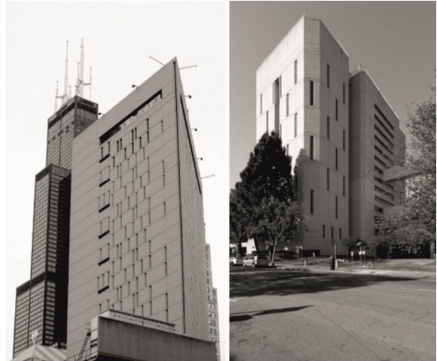
Fig. 4. Metropolitan Correctional Center in Chicago, USA