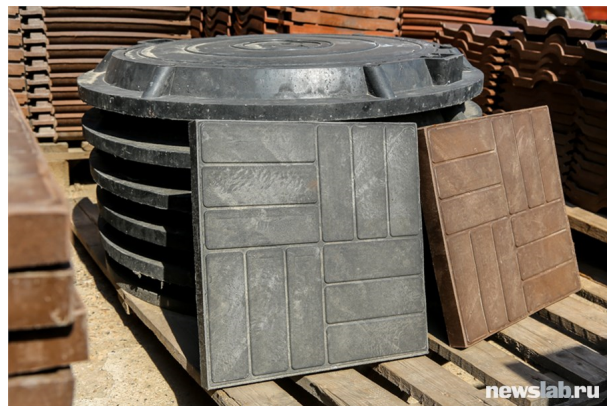
Fig. 7. Pavement tile made of polymer-sand composite

New effective materials, including recycled materials, designed to reduce the cost of multi-tiered urban structures, accelerate their erection process, reduce operating costs, and indirectly improve the environmental status of cities as a whole. For example, various products - from insulation materials and exterior facades decoration to individual elements of public spaces [19] (Fig. 7) and urban furniture [20] (Fig. 8) can be made from polymer-sand composite materials or recycled plastic.