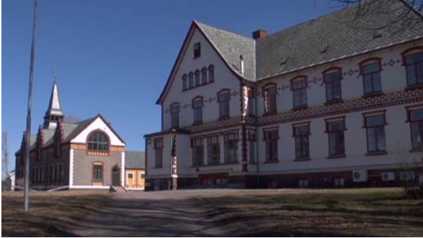
Fig. 2. Correctional Facility in Bastøey, Norway

correctional facility in Bastøey, Norway (Fig. 2), Florida State Correctional Institute in Marianna, US, and more [11]. Techniques for forming a distinctive compositional connection of buildings and structures with the environment – landscape or urban development – contribute to the inclusion of such institutions in the existing system of architectural and urban development, increase the socio-psychological “transparency” of the correctional system and improve the interrelationship.