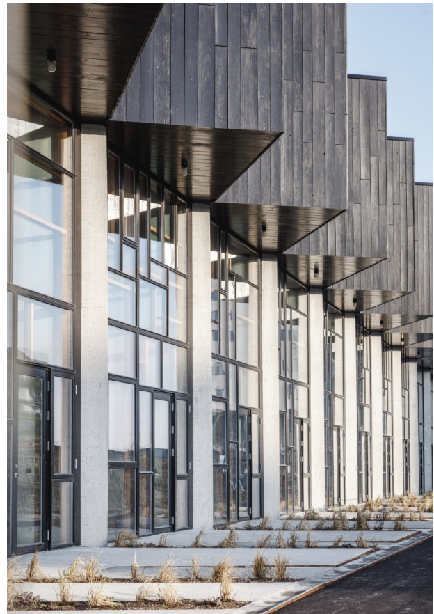
Fig. 9. Residential complex in Copenhagen, Denmark, by Lendager Group, https://www.dezeen.com/2019/04/16/upcycle-studios-townhouses-lendager-group-copenhagen-recycled-materials/

These materials can used in the mass industrial production of prefabricated architectural elements and decoration materials, mainly for non-residential construction. Exactly physicomaterial properties allow used them forbearing and self-bearing structures of low-rise buildings and structures. The recyclable materials have good performance characteristics, low thermal conductivity. They are safe with the addition of flame-retardants, stabilizers, and non-combustible binders such as concrete. Therefore, it is reasonable to use them for the production of bearing structures of any type of buildings and structures or as finishing materials [28, 29] (Fig. 9, 10).