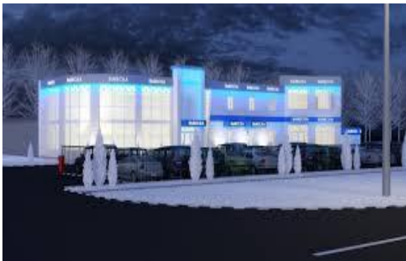
Fig.1. Lighting of the façade of the car service by way of creating a light contrast between the evening appearance of the given controversy and the surrounding landscape

3. Hidden architectural lighting. With the help of a light source creates its own pattern,