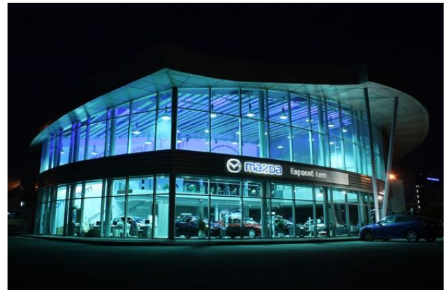
Fig.5. Lighting of glass facades inside line lanterns on the example Motor Show "Eurosib Mazda"

ity of safe orientation in space; the lack of eye-catching points, or vice versa, unnecessary attraction of attention; the use of finishing materials and their colors (which are poorly consistent with ambient lighting or even absorption of light), pale or aged in cool tones coloring the surrounding surfaces; failure to take into account energy consumption, excessive