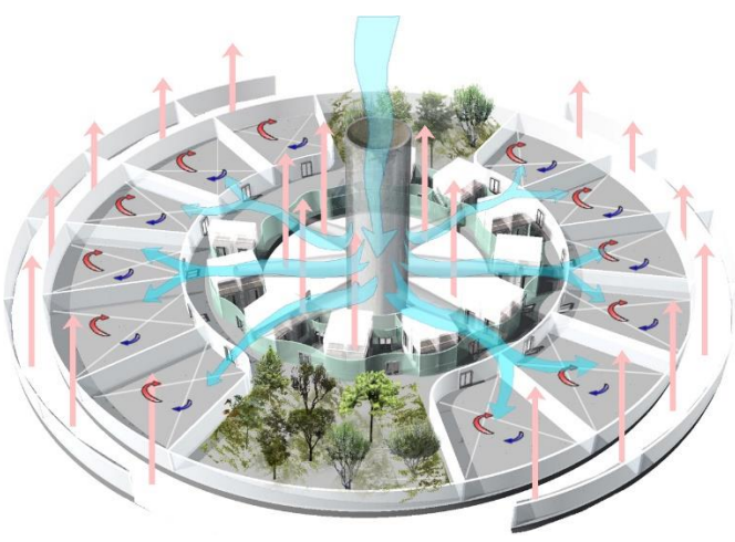
Figure 3 Spatial scheme of the ventilation system in "Bietekoton"

where c_p = 1006 \text{ J/(kg·K)} – isobar heat capacity of air (Mileikovskyi & Klymenko, 2016);