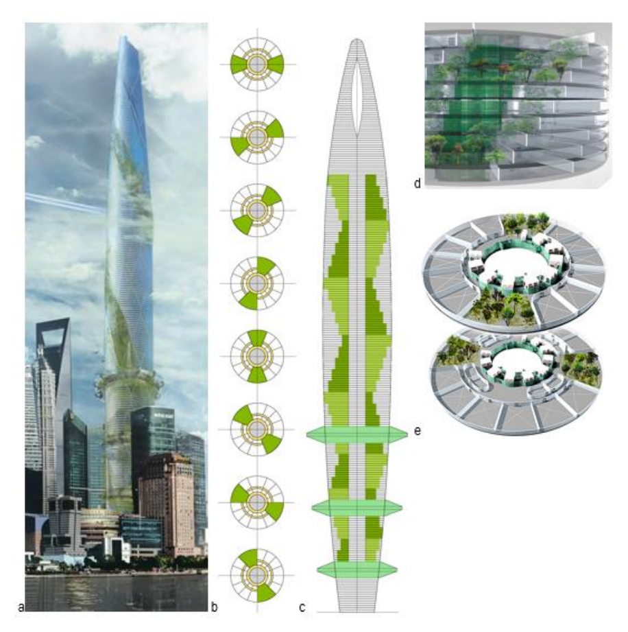
Figure 5 A three-dimensional planning solution of the biotecton planting system: a – general view of "Biotecton", b – floors with greening; c – section of greening; d – general view of "green zones"; e – turn of greening zones on different floors

For the accepted assortment of plants, it is possible to calculate the total sequestration of CO_2 \Delta S [mg/s]. Then the decrease in the concentration of CO_2 [ppm] in the air passing through an "oxygen garden" with the flow rate G [kg/s] is [ppm]