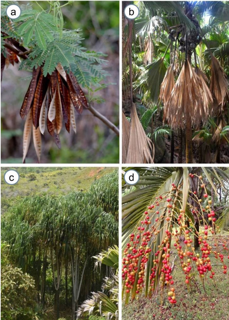
Fig. 3. Examples of substrates for myxomycetes. a: Leucaena leucocephala , Praslin, b: Lodoicea maldivica (endemic) in Vallée de Mai, a World Heritage Site, Praslin, c: Martellidendron hornei (endemic), La Plaine hollandaise, Praslin, d: inflorescence with ripe fruits of Nephrosperma vanhoutteanum (endemic), Mahé, National Biodiversity Centre.