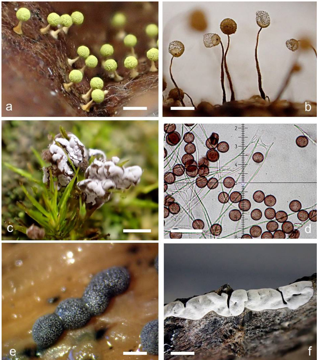
Fig. 2. Myxomycete species collected in the Seychelles. a: Physarum cremiluteum on dead leaves of Terminalia catappa , La Digue, 06-I-2016 (AM2900), b: Cribraria aurantiaca on the trunk of Falcataria moluccana , La Digue, 03-I-2016 (AM2860), c: Diderma saundersii on mosses on Cinnamomum verum , d: Diderma saundersii capillitium and spores (x630), Mahé, 26-VI-2016 (AM3075), e: Physarum cinereum on dry twigs of Epipremnum pinnatum , La Digue, MC (AM 3899), f: Diderma chondrioderma on the bark of living Rhizophora mucronata , Curieuse, MC (AM2834). Scale bars: a scale = 1 mm, b scale = 0.5 mm. c scale = 0.5 mm, d scale = 25 \mu m, e scale = 0.8 mm, f scale = 1mm.