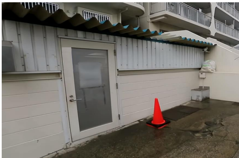
Fig. 3 – Facility for collection, sorting and temporary storage of MSW

In section A of facility organic waste for compost will be collected in containers. Food waste is collected in a paper bag which is thrown into brown bin. Composted waste undergoes further processing into nutrient-rich soils (biohumus).