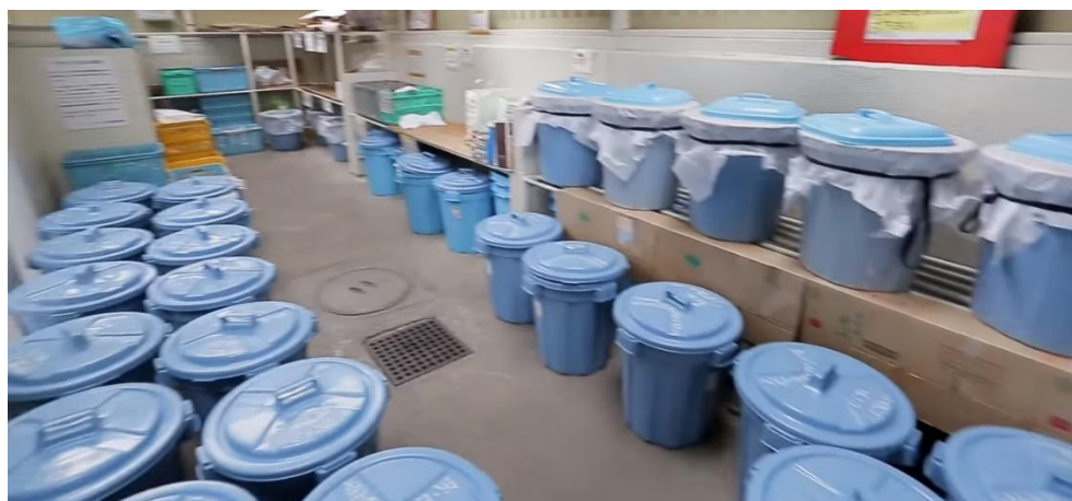
Fig. 4 – Storage facility with bins for sorting waste

The fifth stage includes separation of waste material in residential MSW sorting station. Each type of waste will have its own separate container. Thus, about 35 bins for sorting MSW will be placed in such station facility (Fig. 4).