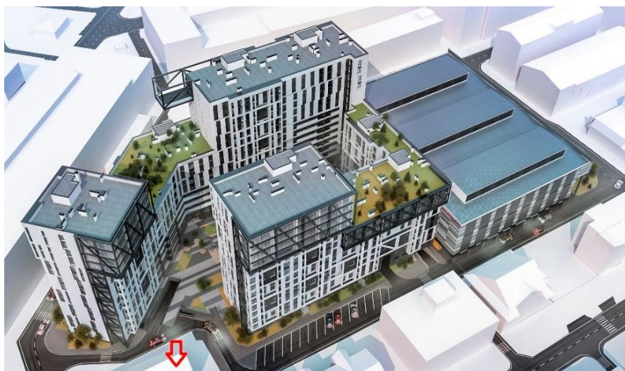
Fig. 2 – Facility for collection, sorting and temporary storage of MSW on the scheme of MUHE

Plastic containers and boxes are placed in this facility. There are several sections in the facility: biowaste, packaging waste, wastepaper, other household stuff (Table).